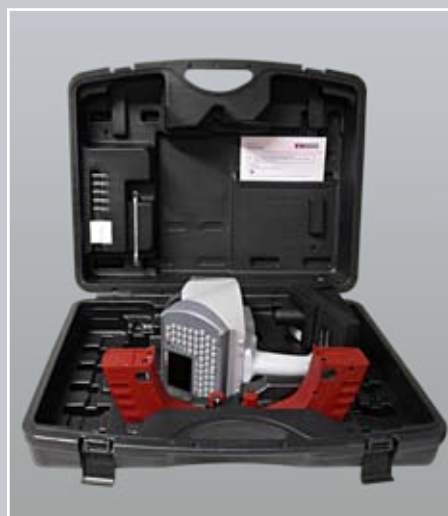
Hard protective case

Those who need to code a lot of information on small space are able to mark a Data Matrix code. You can either type in the letters on a keyboard or transfer them by one of the existing interfaces.